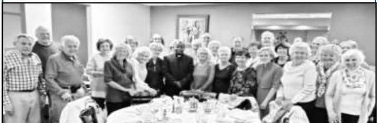
The YES group celebrating an early St. Patrick's Day at the BiVio restaurant.