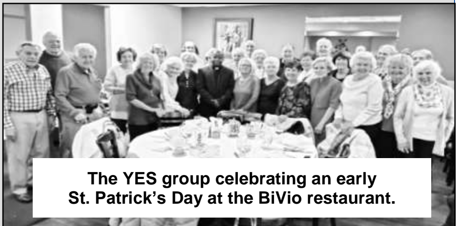
The YES group celebrating an early St. Patrick's Day at the BiVio restaurant.